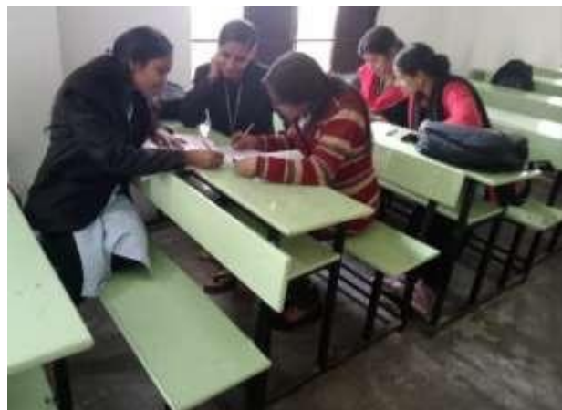
Group work to cater differential learning

Principal Maulana Mazharul Haque Teachers Training College Mathurapur, Samastipur