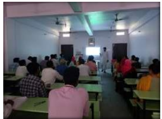
Assistance to slow learner in ICT Resource

Principal Maulana Mazharul Haque Teacher's Training College Mathurapur, Samastipur