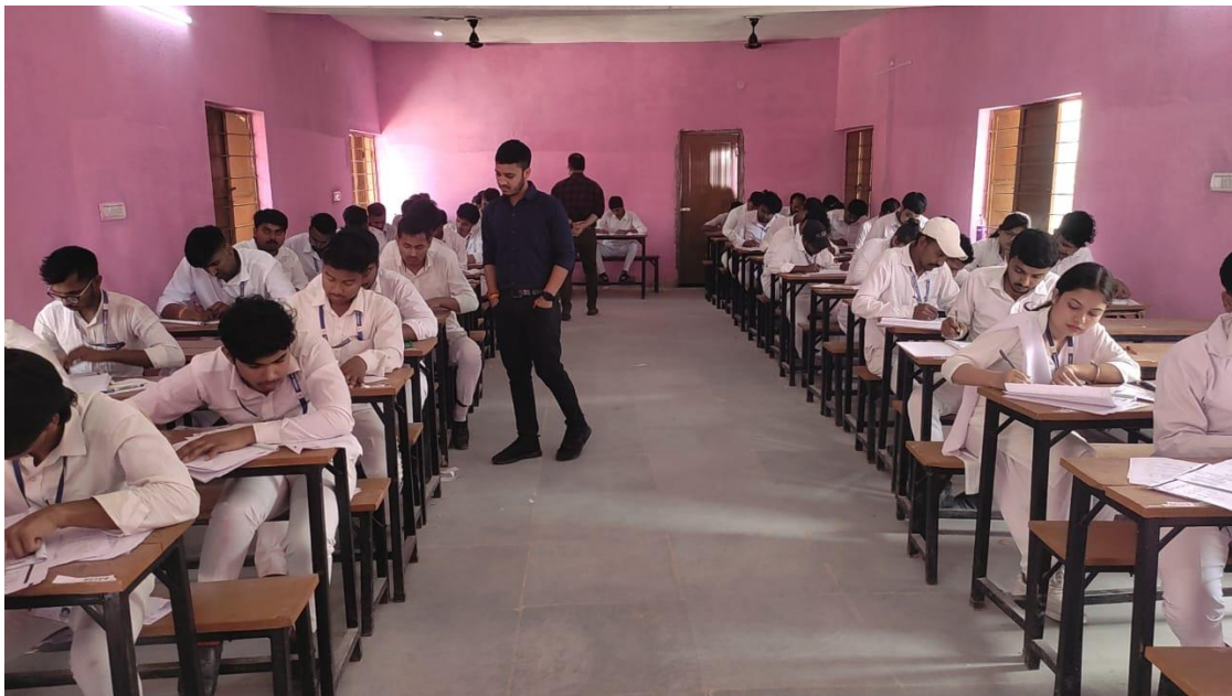
Teacher taking internal assessment of the students